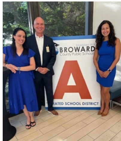
Manatee Bay Elementary, Admin Team